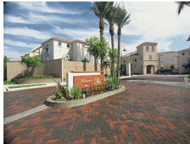
Pioneer Villas Opened in 2001