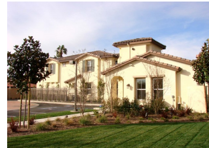
Fountain Walk Opened in 2007