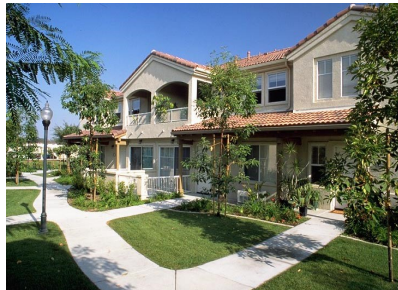
Emerald Villas Opened in 2000